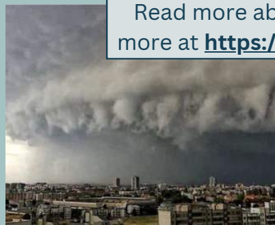
Hurricane without DPE July 10, 2019, Italy.

Read more about this and more at https://dpe100.com