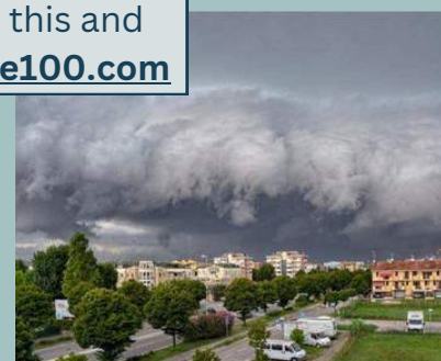
No hurricane was able to form under a similar cloudburst with DPE.

To find your DPE store, visit: stores.agohealp.com